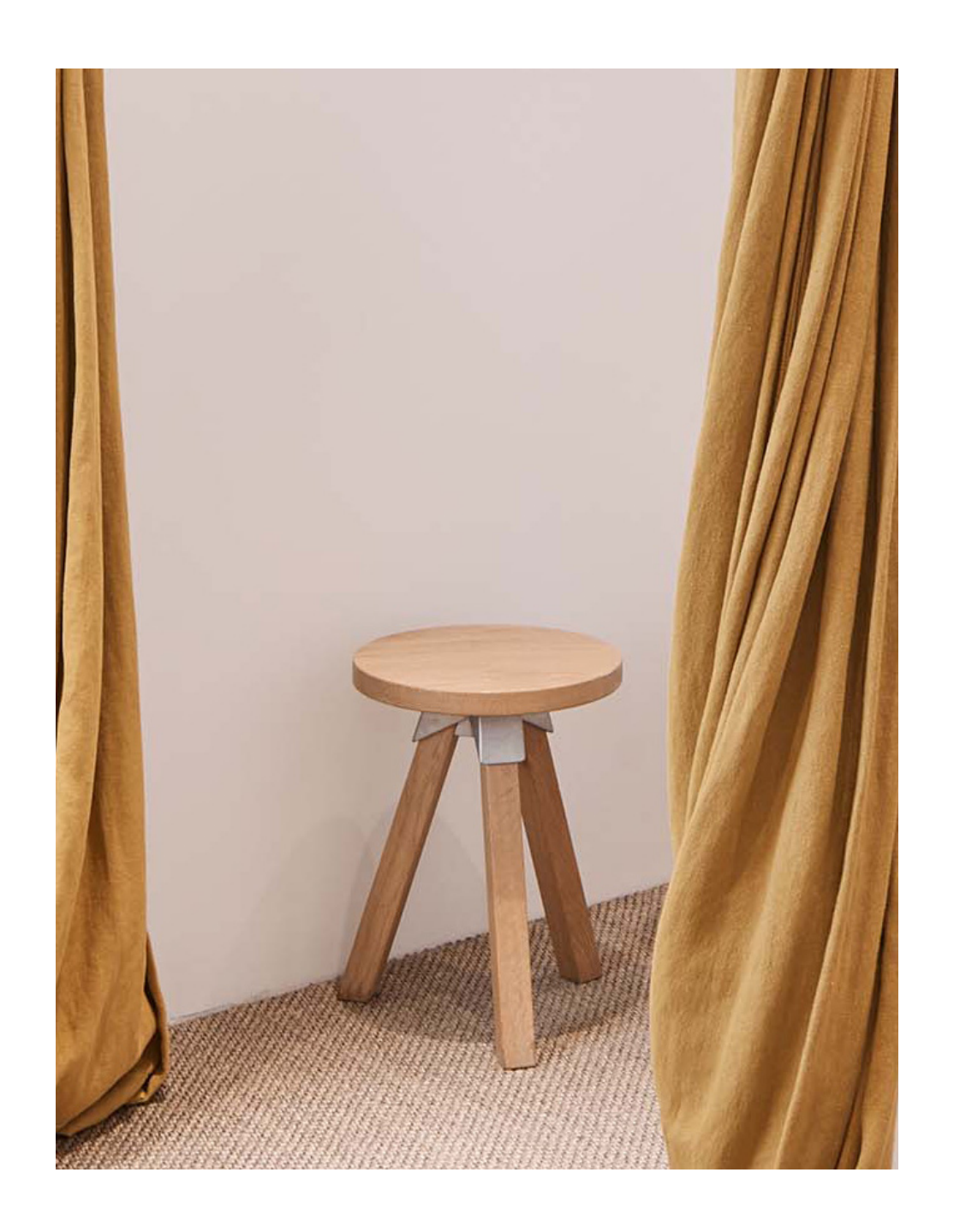
A-joint Stool Product Data Sheet