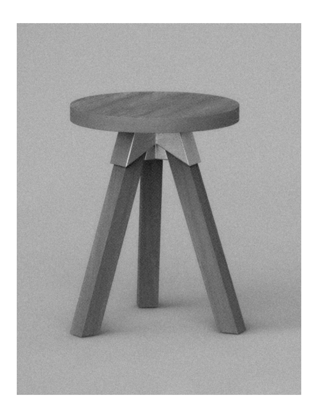
A-joint Stool Product Data Sheet